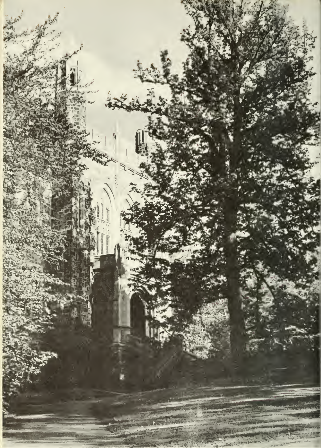
Some 410,000 volumes are housed in the University Library.