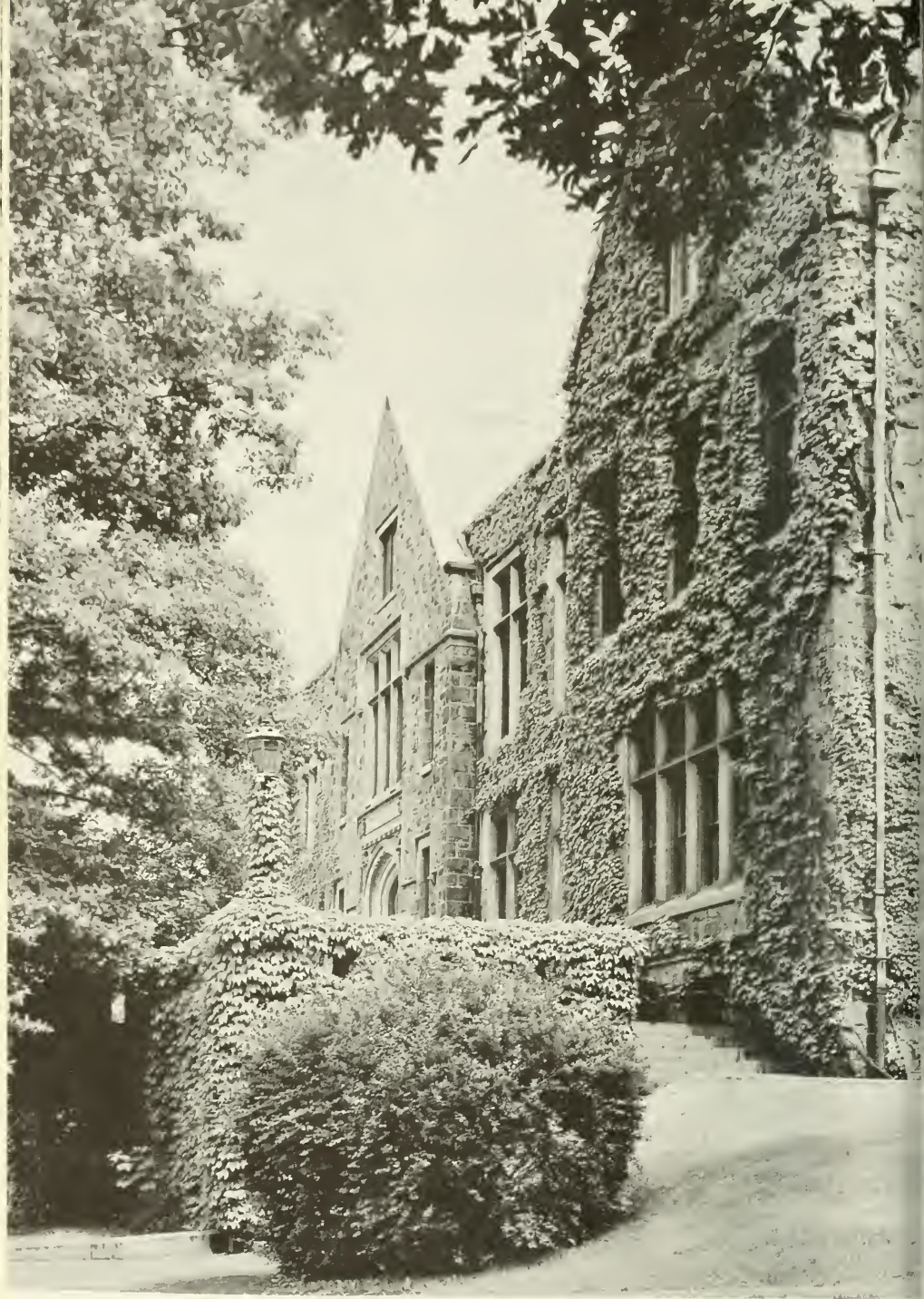
Drown Hall houses the College of Business Administration.