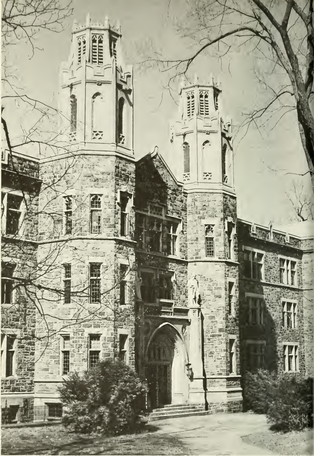
Four engineering departments are in James Ward Packard Laboratory.