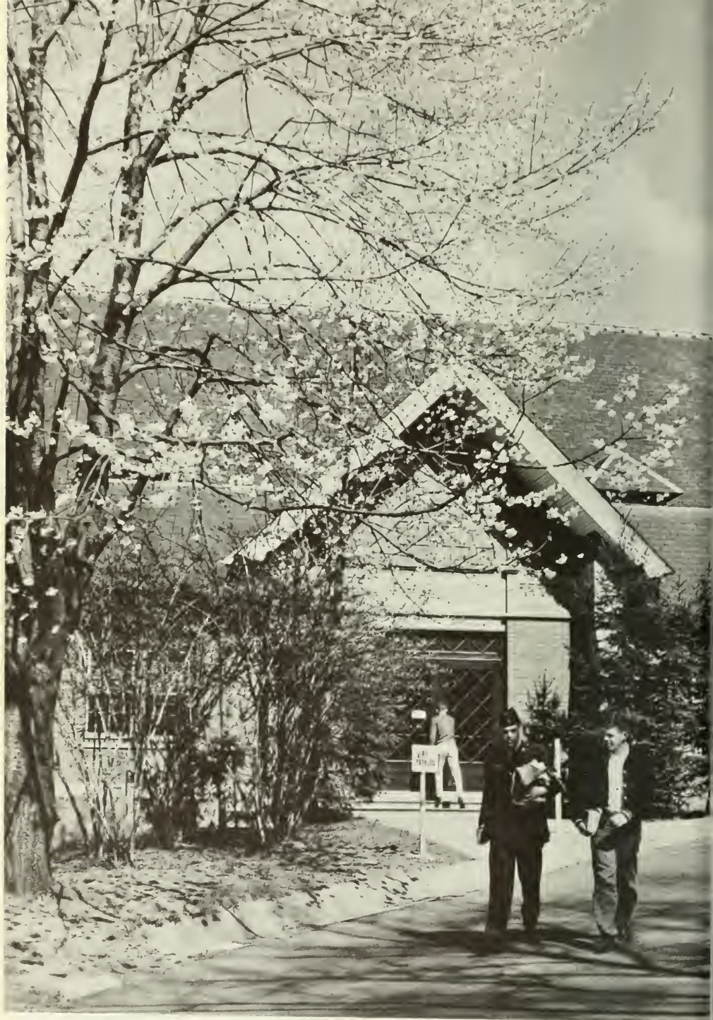
Several Arts and Science departments are in Lamberton Hall.